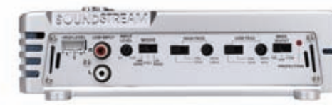
2 channel Models