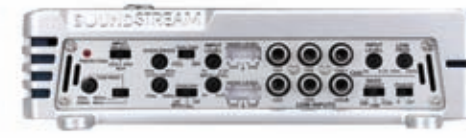
5 channel model