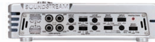
4 channel models